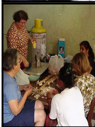
TOP: Students of the Bible Institute in Cienfuegos.