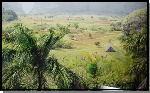
The Valley of Viñales in Pinar del Rio.

One of the highlights of the trip was being able to preach in a mission that was started 4 years ago on my first trip to Cuba. In the province of Pinar del Rio, lies the