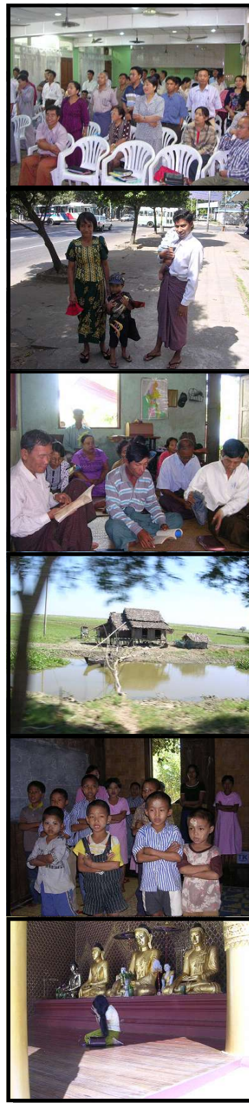
TOP: The Missionaries together enjoying the fellowship. SECOND: Taking home dinner. THIRD: New converts in a Mission House. FORTH: Typical home in Myanmar. FIFTH: Children in the orphanage singing. BOTTOM: Woman praying in Buddhist temple

It is amazing to see all that is being done in Myanmar through our National Pastors and Missionaries. It is even more amazing when you realize they do it on less than $50.00 a month. Over $1,700.00 was left to help these men with food and medical attention that is so desperately needed. Monthly support for 70 men is sent through NOW Ministries, but there is so much more that could be done. There are many more people that could be reached. They have the man power, but they lack the resources. We need more supporters, and more funds to spread the Gospel across Myanmar. As I sat listening to the College students sing on the last night we were there, I realized that these young people were the spiritual future of Myanmar. If Myanmar is reached with the Gospel, it will be done through these young people and others like them. Please pray for them as they face much hardship, and please support them. With your help, Myanmar can be reached for Jesus Christ.