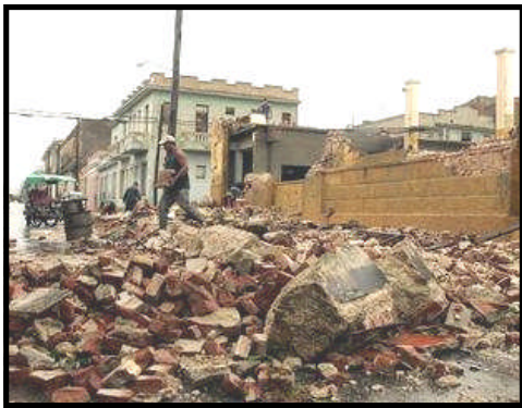
Just a sample of the damage caused by Hurricane Dennis in Cienfuegos, Cuba

Like a runaway locomotive, hurricane Dennis came ashore in Cuba with a direct hit on Cienfuegos. The sustained winds were 149 mph with gust of 177mph. The flooding was massive and wide spread throughout the town of 100,000 people. Hundreds were left homeless and the whole city is without power.