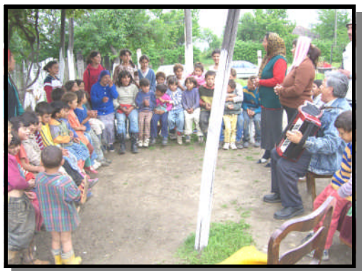
Singing in the Gypsy church in Satu Mare

This was my first trip to Romania to visit the Pastors that are supported by NOW Ministries, so I was unsure what to expect. I flew to Budapest, Hungary