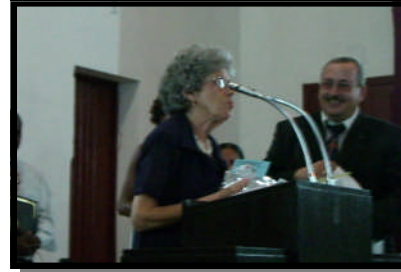
TOP: Graduates of the Cuba Bible Institute. SECOND: Bible Institute Choir. THIRD & FOURTH: Students receiving Diplomas. FIFTH: Attendance of family and friends at the Graduation. SIXTH: Valedictorian giving speech.