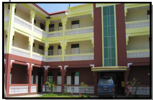
The Bible School in Myanmar.

worked hard to invite family and neighbors. When the invitation was extended, over 25 Cambodians turned from Buddhism and accepted Jesus Christ as their personal Savior. Later that same day